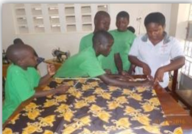
16+ youth taking measurements during tailoring class