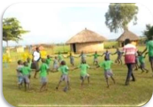
Teachers with children for physical exercise