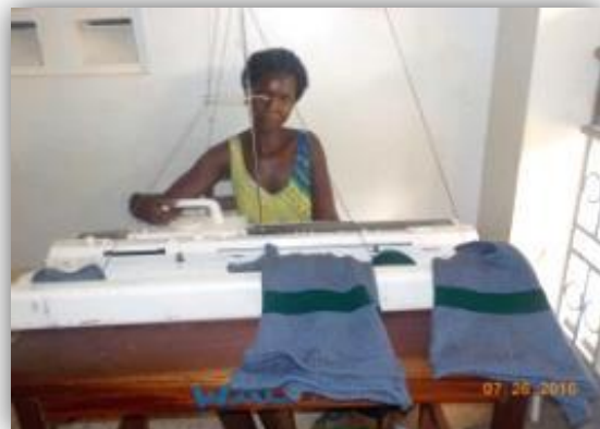
A hearing impaired student knitting a cardigan for a child