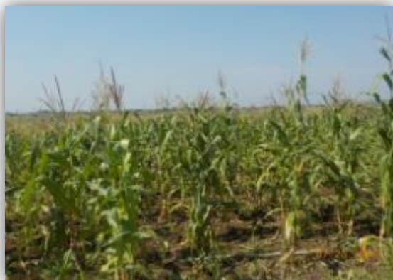
The Companions of the Sacred Hearts help to support the residents at Guadalupe House through growing of maize and vegetables.

Francis Opwoya is an 11 year child with cerebral palsy. He was only able to move by crawling and had poor upper limb stability and was unable to feed himself or to stand or walk independently at the time of identification. He underwent short-term physical/occupational therapy rehabilitation; he gained the ability to self-feed and was gradually able to stand, walk independently though with an awkward gait pattern for a short distance. He is now able to do activities like pumping water in a standing position.