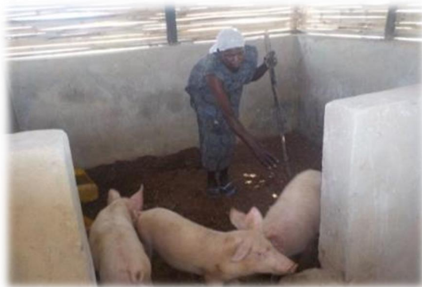
Some of the pigs being reared using Indigenous Micro Organism by WACFO groups