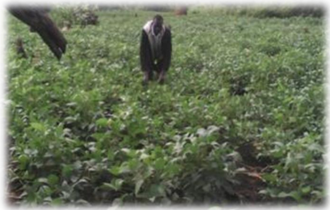
WACFO Field Extension Worker inspecting cabbage and soya bean planted by the groups