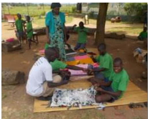
Children with special needs enjoying craft work