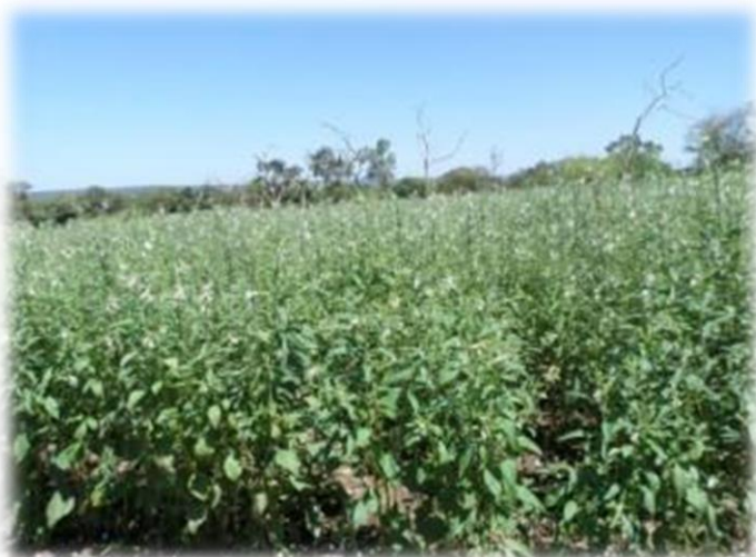
Kwo Tek farmer's sesmes garden